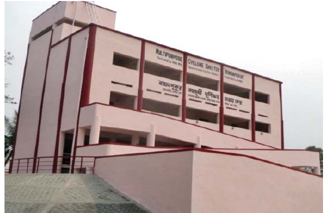
Cyclone Shelters at Kaushangra, North 24 Parganas District under PMNRF

EPIL plans to complete the construction of the remaining seven shelters in 2017.