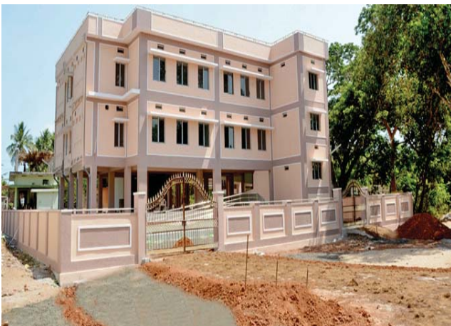
MPCS, East Godavari District

4.3 M/s. Telecommunications Consultants India Ltd. (TCIL), a Public Sector Undertaking of Government of India, is the knowledge partner for suggesting technology for developing Early Warning Dissemination System (EWDS) to ensure last mile connectivity in pre/during/post cyclone period. Andhra Pradesh has awarded the contract for EWDS to M/s Larsen & Toubro at a cost of Rs.82 crores and the installation is likely to be completed by September, 2017. Odisha has also awarded the contract at a cost of Rs. 66 crores to M/s Larsen & Toubro and installation is likely to be completed by July, 2017.