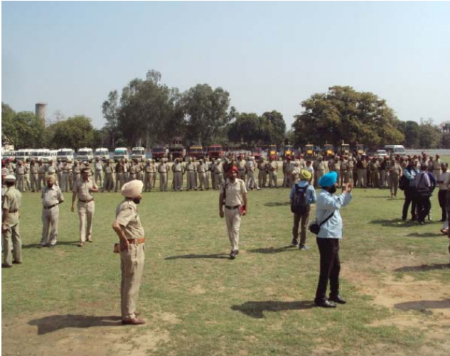
Figure 5 Staging Area