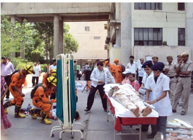
Figure 7 Casualty Evacuation

Assets, Civil Defense & Home Guards take active part as part of composite Task Forces. Most of these exercises are also attended by elected representatives and senior level functionaries at the State level. These exercises are also widely covered by the local print and electronic media, thus spreading the awareness amongst large number of people.