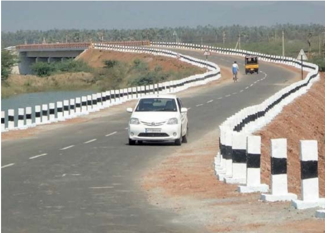
Bridge, East Godavari District