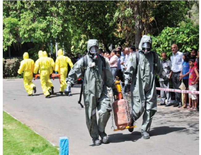
Figure 6 CBRN Search & Rescue Operations

6.6 Mock exercises have helped in creating a culture of preparedness at the grassroot level. Representatives of the community as well as students participate in large numbers in most of these exercises. The District Administration, the Corporate Sector and other First Responders have shown tremendous enthusiasm. The Armed Forces, NDRF, SDRF, local police, Fire & Emergency Services, Medical