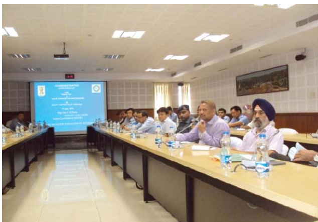
Figure 1 Coordination Conference