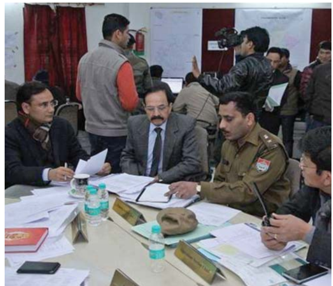
Figure 4 EOC Planning Phase