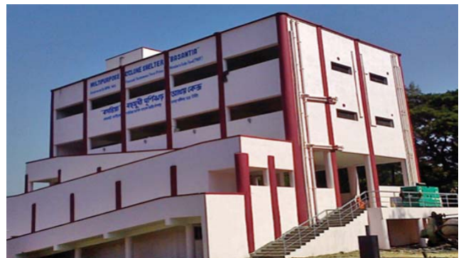
Cyclone Shelters at Purba Mukundapur, East Medinipur District under PMNRF