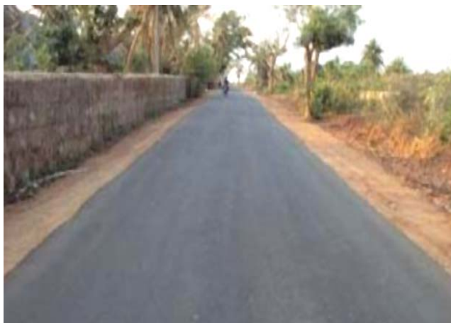
Connecting BT Road