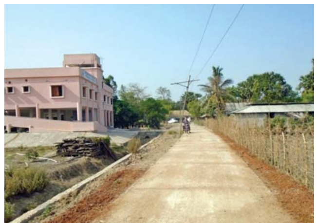
Connecting CC Road