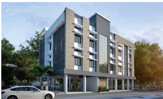
Bird's eye view of proposed multipurpose Evacuation cum Community Centre at Minicoy Island of Lakshadweep

and UT Admn. of Lakshadweep has been signed. To assess the technical adequacy of design and drawing of the shelter, a meeting of the Technical Advisory Committee (TAC) with experts drawn from IIT-Kharagpur and Structural Engineering Research Centre (SERC), Chennai, was held on 17.08.2016. The final design, vetted by a third party, has been accepted by TAC members and the approval has been communicated by NDMA to Lakshadweep Administration. CPWD has requested for revising the estimates for an amount of Rs.3,36,99,200/-. The justification for the same, however, is awaited. The project has a timeline of 24 months i.e. 17.07.2018.