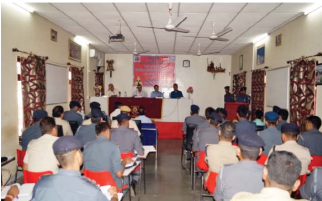
Training programme on Mobile Radiation Detection System