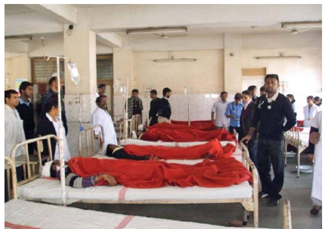
Figure 8 Hospital Surge Capacity