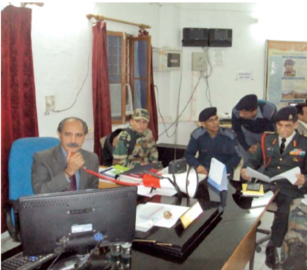
Figure 3 EOC Observers

before the actual mock exercise. The exercise is conducted on a simulated scenario. Incident Response System (IRS) is used as a response mechanism- EOCs are activated, Staging areas and Incident Command posts are established, wireless and Satellite phones are used in case of communication breakdown and composite Task Forces are created to respond as per requirement. These exercises enhance the ability to respond faster, better and in an organized manner during the response and recovery phase.