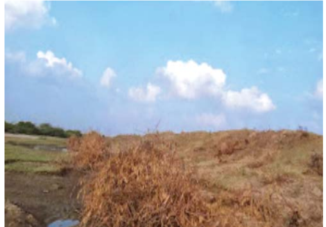
Kona Saline Embankment, Krishna District