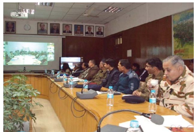
Figure 2 Table Top Exercise