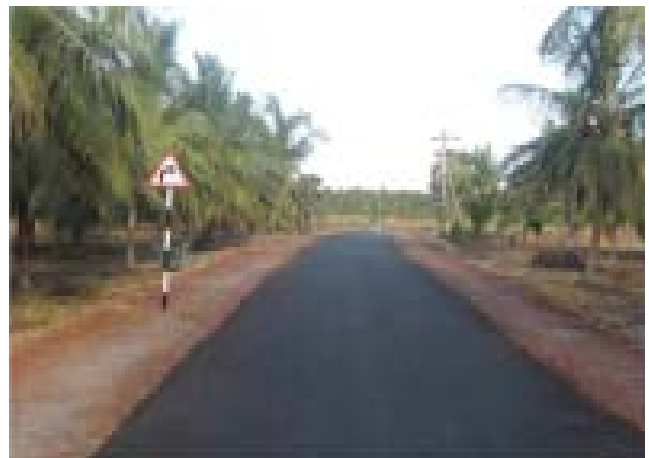
Connecting Road, Vishakhapatnam District