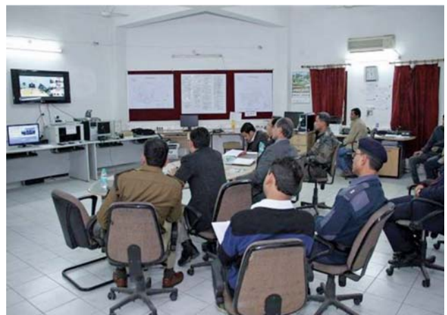
Figure 9 & 10 Hot wash and debriefing session with State officials and on video conference with district HQs